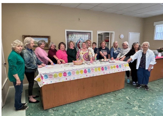
Super Seniors modeling their new “jewelry”!

The Super Seniors met on March 21st to stuff Easter eggs for the Children’s Easter Egg Hunt to be held after church services on Easter Sunday. It was a great time with food, fun, fellowship and the cutest Easter goodies to stuff!!