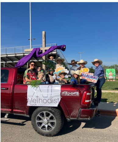
Cowboy Homecoming Parade Our entry won Third Place!